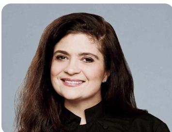
Alex Guarnaschelli 9/29