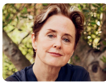
Alice Waters 7/28