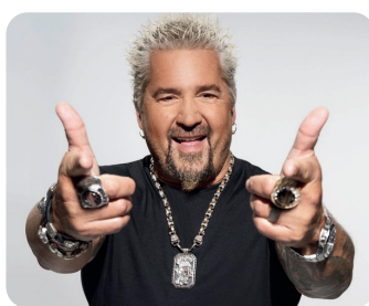
Guy Fieri 6/30