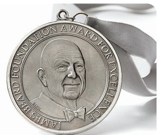
James Beard 12/29