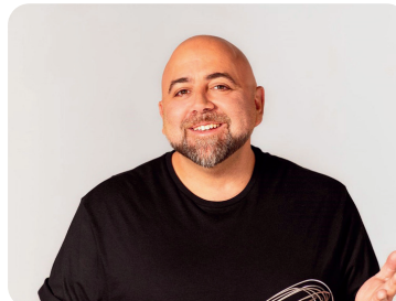
Duff Goldman 11/24