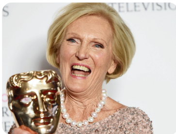
Mary Berry 5/19