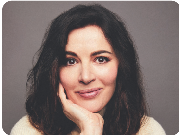
Nigella Lawson 1/27