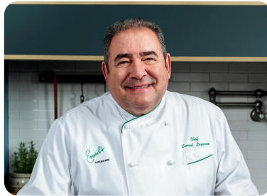
Emeril Lagasse 2/24