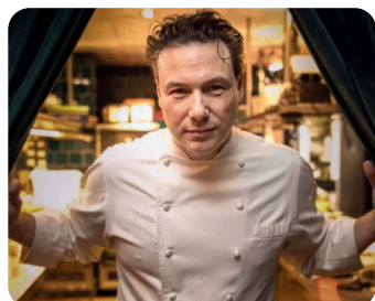
Rocco Dispirito 10/27